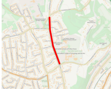
Works area: —————

What we are doing We are carrying out resurfacing works on Whyteleafe Road, Caterham.